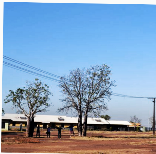
The June 2012 Tooth Mob team between Boabs in Wadeye

Before heading to Wadeye, each Tooth Mob Volunteer receives a handbook detailing cultural considerations and community resources, and also a pre-departure briefing from the Tooth Mob Project Officer. NT Health provides a day of training in Darwin in the appropriate data systems, in addition to outlining cultural awareness in a health context. Tooth Mob and NT Health provide ongoing support throughout the Volunteer's time in Wadeye.